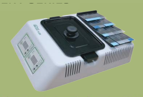
Floatation/Drying Workstation FL220