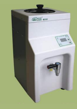
Wax Dispenser WD360