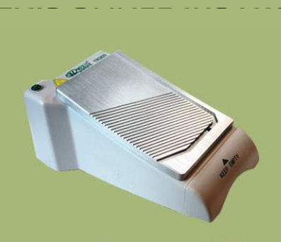
Wax Trimmer TR230