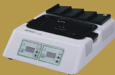
Floatation/Drying Workstation FL220