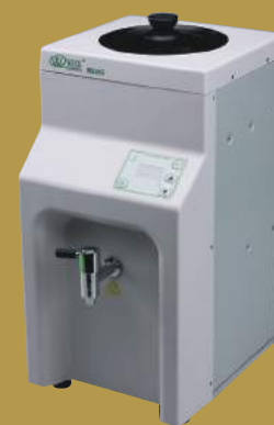
Wax Dispenser WD360