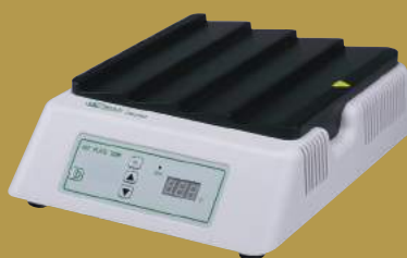
Slide Drying Hotplate DR230