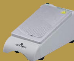
Wax Trimmer TR302