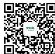
Wechat QR Code

Website: www.wexisgp.com Email: marketing@wexisgp.com